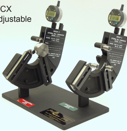
Series CX/CX External Adjustable