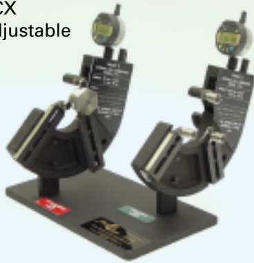
Series CX/CX External Adjustable