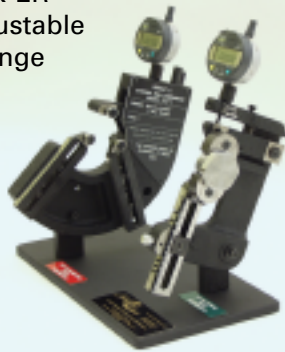
Series BX/CX-ER External Adjustable Extended Range